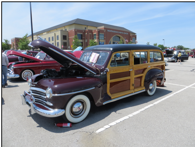
Bill & Claire Haire, Omaha - 1948 Plymouth

TBA - Tours to be arranged. Several possibilities include a York area tour as well as the Stuhr Museum in Grand Island and the Minden Christmas lights.